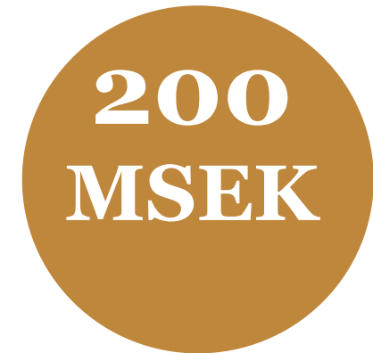
Future Estimated Annual Cash-Flow (5 years)

Geographic Focus, Solid & Consistent Local Knowledge Performance