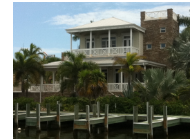
the Little Palm Cottages® THE SMART CHOICE IN THE LOWER KEYS