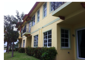
the Bridgewater® THE SMART CHOICE AT LAKE OSBORNE