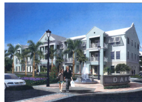
the DAKOTA® THE SMART CHOICE AT ABACOA