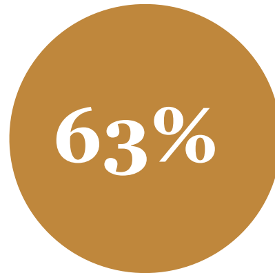
Average Return on Equity