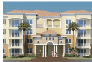
the Riverwalk Pointe® THE SMART CHOICE IN MANGROVE BAY