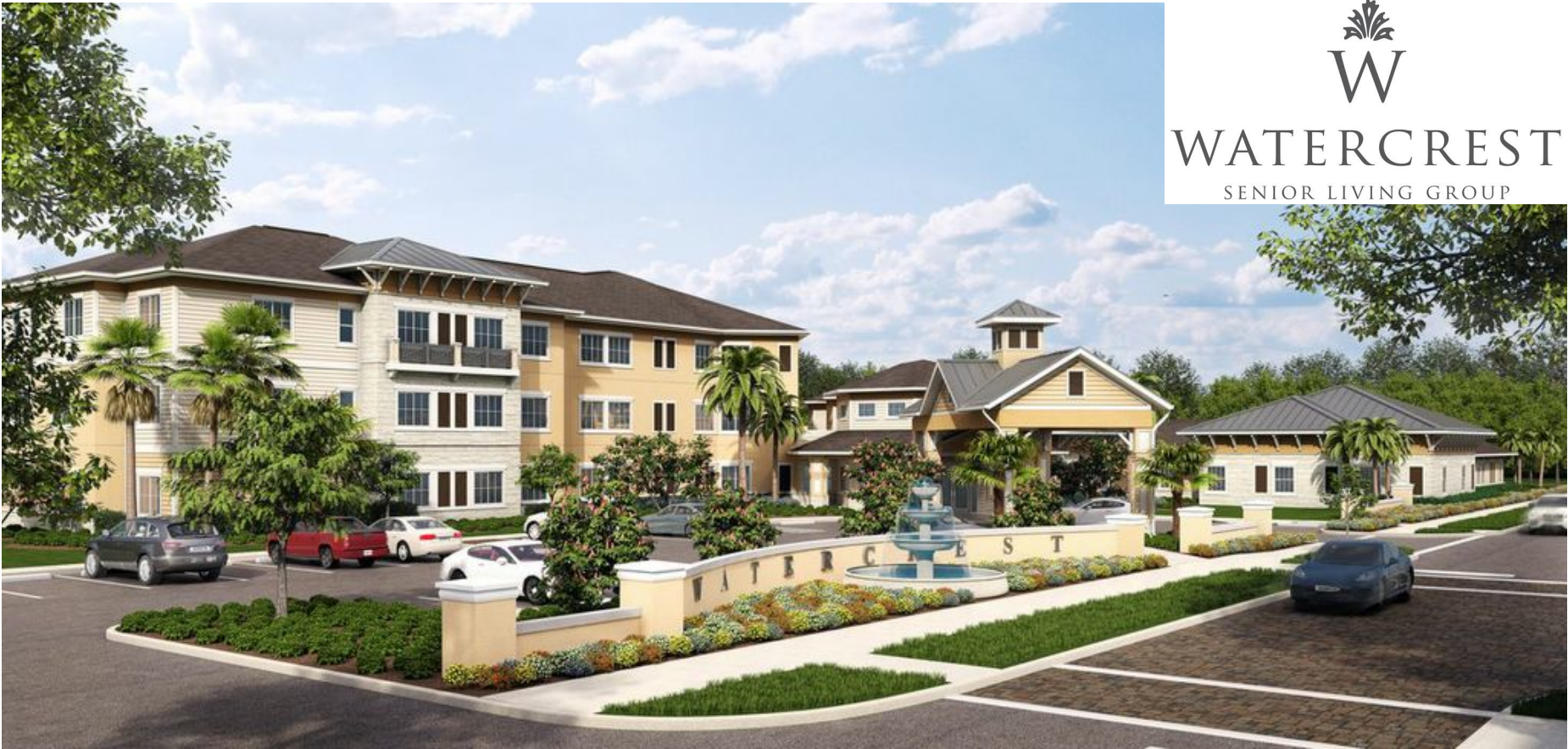
Watercrest Senior Living Group